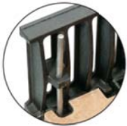
Detailed view – PROFIX locking system